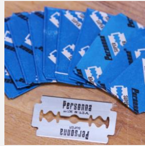
10 Pack of Razor Blades

Handle, 3ft Wooden Oven Peel Price: $12.00 Item #: SWPEEL-315