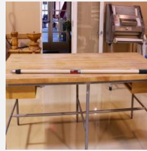
Telescopic Ext. Pole 6-12 ft., Sherlock with Metal Thread WS612