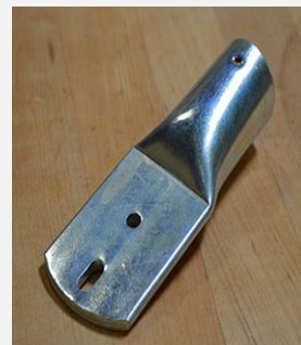
Hardware for 20" Oven Broom (Item #SWBRUSH-1565), Handle Attach, Needed with Telescopic Pole, Opening of 1" Diameter for Wooden Handle