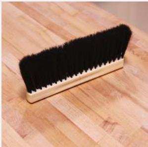
Flour Broom 30cm, Dark Bristle (100% horsehair)