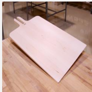
Wooden Oven Peel, 18"x36" no Handle