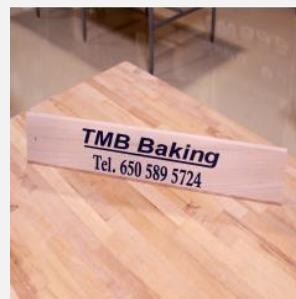
Flipping Board, 27.5"x4" with Inscription: TMB Baking