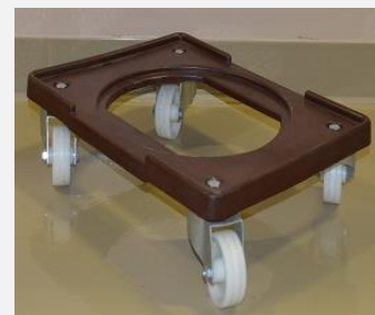
Trolley for Item# SWCONTAINER-BAC008, 19"L x 14 5/8"W x 5 1/8"H

Price: $27.50 Item #: SWCONTAINER-BAC008CI