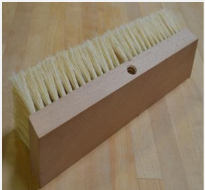
Oven Broom, 16" for Stone Deck Oven, Tampico Bristles