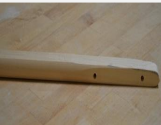
Handle, 8ft Wooden Oven Peel Handle/Pole Price: $14.50 Item #: SWPEEL-815

Handle, 3ft Wooden Oven Peel Price: $12.00 Item #: SWPEEL-315