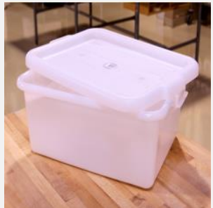
Bus Tub- Size: 17"x12.75"x7" Deep, Top OD-20"x15 1/4" (21.5" w/handles) 20 lbs. Capacity

Price: $10.00 Item #: SWCONTAINER-152705