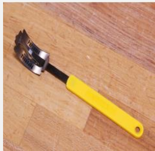
Blade Holder/Lame with Attached Plastic Holder