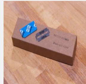
Box of Razor Blades, 250 Count

Price: $42.00 Item #: SWBLADE-6001390001