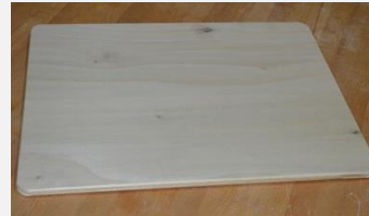
Wooden Proofing Board 18"x26", 3/8" Thick, Made of 5-Ply Poplar Wood

Price: $42.00 Item #: SWBLADE-6001390001