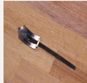
Blade Holder/Lame- Medium Ball