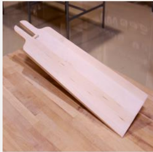
Wooden Oven Peel, 8"x36" no Handle