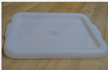
Bus Tub Lid - Size: 15"x20x21.5" - White

Price: $10.00 Item #: SWCONTAINER-152705