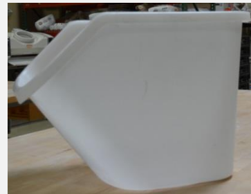
Container for Ingredients, 50 lbs. Flour Capacity, White PP, Height 17 5/8" x 17" Width

Price: $41.00 Item #: SWCONTAINER-BAC008