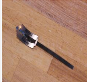
Blade Holder/Lame- Large Ball