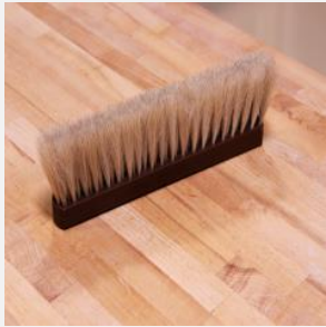
Flour Broom 30cm, Light Bristle (Horsehair and synthetic mix)