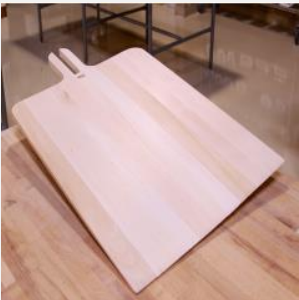
Wooden Oven Peel, 22"x36" no Handle