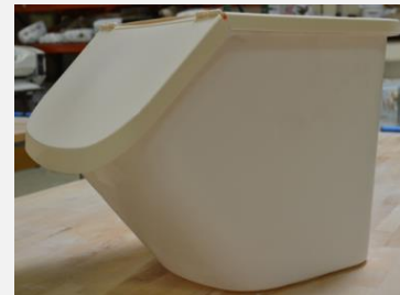
Cover for Container Item# SWCONTAINER-BAC008, Ivory, Height 1 1/8" x 17" Width

Price: $41.00 Item #: SWCONTAINER-BAC008