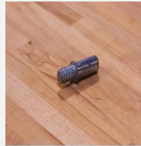
Metal Threading for Broom Handle