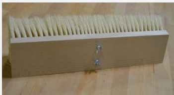
Oven Broom, 20", Wooden Head with Natural Bristles