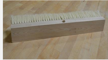
Oven Brick Hearth Broom, 24"