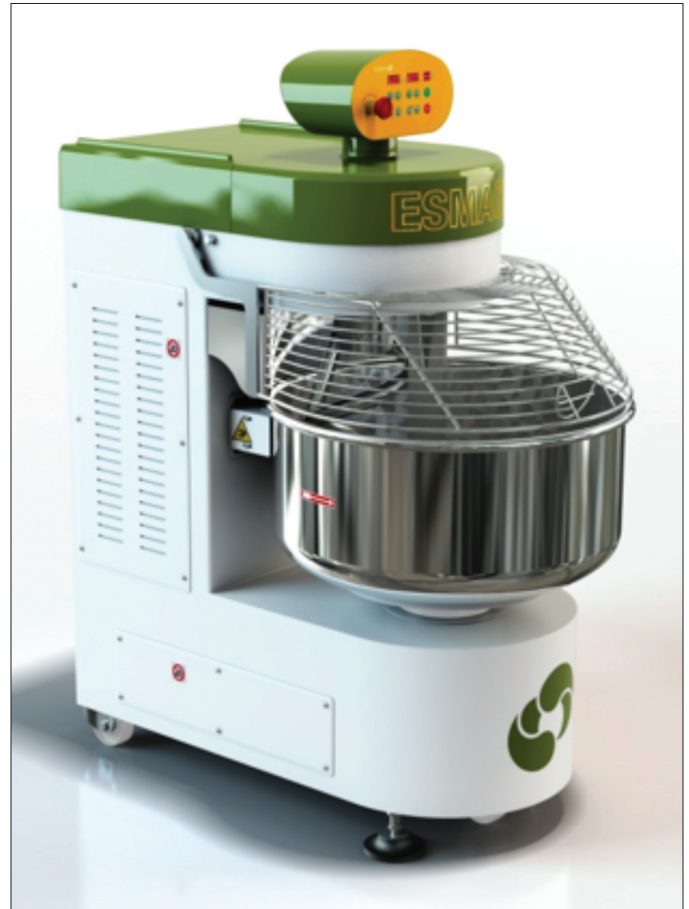
Esmach SPI F

Models: 30, 45, 60, 80, 100, 130, 160, 200 Dough Capacity: 4.4 lbs. min to 441 lbs. max Electrical: 208-220V/3-PH/60hz/AMPS determined by individual model